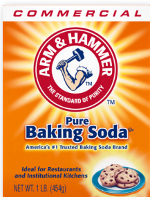
Arm & Hammer™ Baking Soda 1 lbs. Box Item # 33200 - 84104 Pack: 24/16 oz.