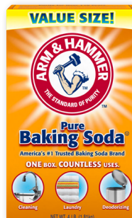
Arm & Hammer™ Baking Soda 4 lbs. Box Item # 33200 - 01170 Pack: 6/4 lbs.