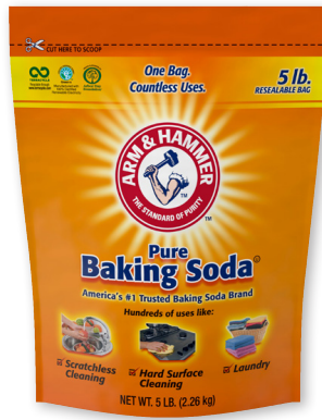
Arm & Hammer™ Baking Soda 5 lbs. Item # 33200-97267 Pack: 4/5 lbs.