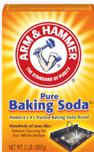
Arm & Hammer™ Baking Soda 2 lbs. Box Item # 33200 - 01140 Pack: 12/32 oz.