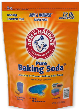
Arm & Hammer™ Baking Soda 12 lbs. Item # 33200-01931 Pack: 4/12 lbs.