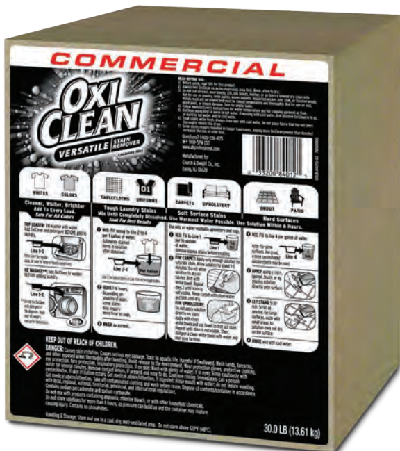
33200-84012 1/30 lbs.

The unique formula is activated by water, unleashing bubbling oxygen power for effective cleaning when used as directed. It boosts your laundry water pH to improve your detergent's cleaning ability, and its special ingredients are designed to help rinse soils away. For all washing machines including HE. Chlorine free and color safe. Also cleans carpets, upholstery, floors, grout and patio furniture. Available in three sizes.