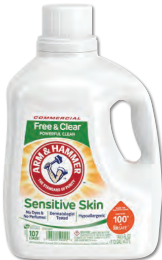
33200-50020 4/144.5 oz. 107 loads