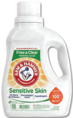
33200-50021 6/67.5 oz. 50 loads