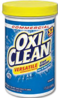
57037-01211 1.5 lbs.