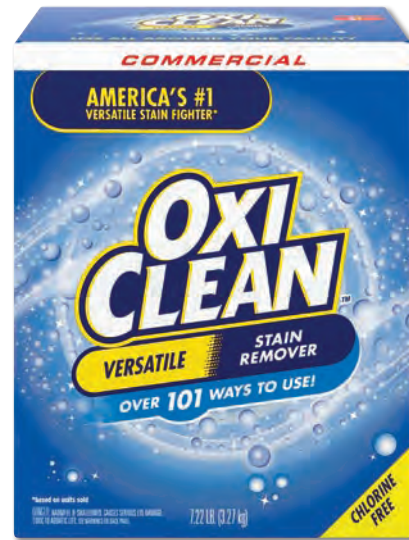
57037-00069 4/7.22 lbs.