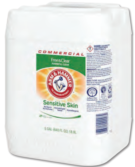
33200-00008 1/5 gallon jug